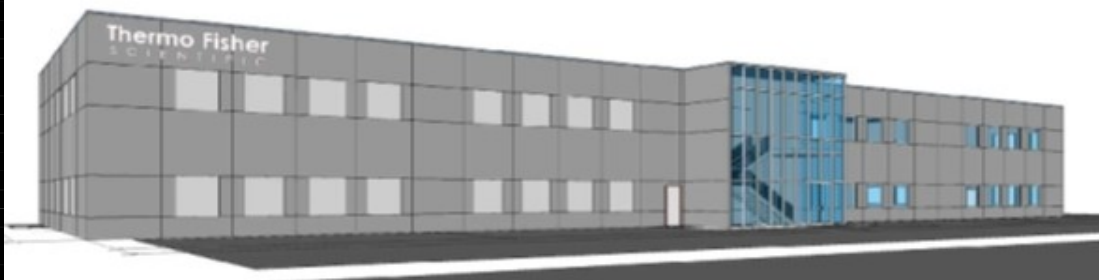
Pictured above is the architect's rendering of Thermo Fisher Scientific's new building that will be located on Main Street, just north of Vance Ford in Miami. Construction started February 15 and is scheduled to be completed in August of this year.